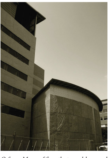
O for a Muse of fire, that would ascend The brightest heaven of invention, A kingdom for a stage, princes to act And monarchs to behold the swelling scene!

2:00-3:00pm Closing Ceremonies ETLC 1-001