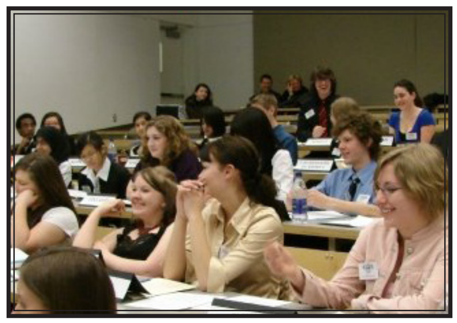
An excited committee of 2008, whose members are no doubt anxious to return to this scene for HSMUN 2009

In these pages, you will discover a collection of articles compiled by our writing staff for the purpose of informing you on a few crucial global events and scenes where crises could very emerge, fearful and terrible. Consider these articles as a good place to begin your research. Need further tips on researching? See our article in this edition.